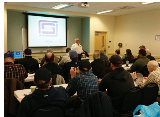
Training and Instruction

Recognizing that superior technical support requires both inside and field-based professionals to properly support the needs of our customers; Spears® Field Technicians are able to assist with multiple customer requests including: